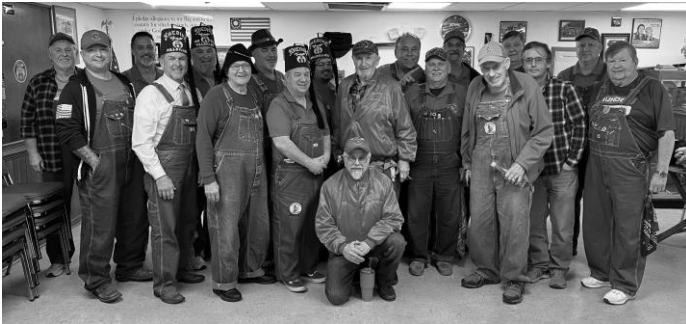
The Hillbillies (Y'all come back now, hear?)